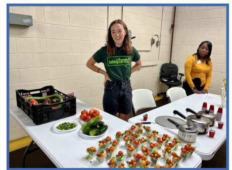
Community Partner: Talking Farm provides samples of their farming bounty!