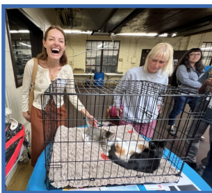
Community Partner: Touched by an Animal displays the nurturing bond between people and their companion animals.