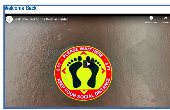
On August 3rd, after four months, The Douglas Center welcomed back some of our participants. Here is a peek at some of the safety precaution guidelines we are following. Click on image to view video or visit our website.

Safety first was and is our first priority. Our reopening preparations included new signage indicating clear direction and a plan for constant monitoring of Covid-19/PPE procedures and guidelines. As per PPE guidelines, our participants and staff must wear masks and maintain at least a six foot distance. These guidelines must be followed by every participant. Any participant not able to follow the guidelines may not be ready to return to The Douglas Center at this time.