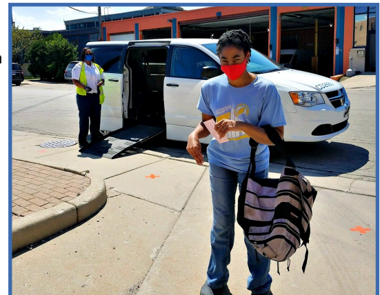
The Douglas Center is greatly appreciative of the support we receive from PACE in assisting with the safe return of our participants.

The Douglas Center and the PACE Suburban Bus Company formulated a transportation plan to ensure the safety of those we serve as we return to some sense of normalcy for our participants. Pace has agreed to transport only one individual at a time. The only exception being when more than 2 participants live in the same house. The seats not in use are closed off with yellow caution tape for each van or bus, so that participants are aware of where they can sit. Additionally, there is a six foot distance from the driver and participant seating.