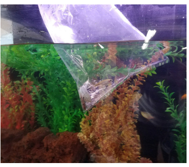
Welcoming the "rescue fish" as they get accumulated.