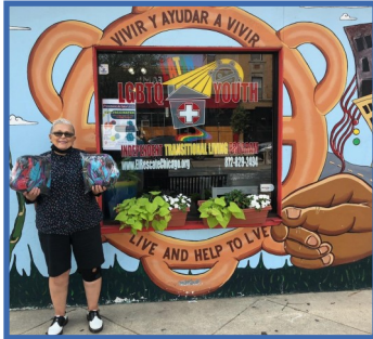
El Rescate receives mask donation from The Douglas Center

The Douglas Center would like to express our sincere gratitude to Zoomagreen for their wonderful work in bringing recycling to higher level, one that serves the community and the planet.