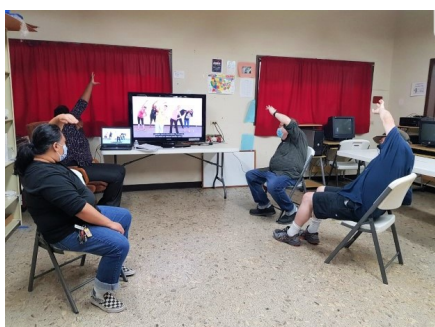
The Douglas Center participants learn how to improve their health in the Health Matters™ Program

In this program, six participants of The Douglas Center meet for 1 hour, three times a week for 32 weeks. The program teaches core concepts related to physical activity, nutrition, health education and social engagement. Participants also engage in exercise classes. At the conclusion of each session there is a question-and-answer period for our participants to review what has been taught.