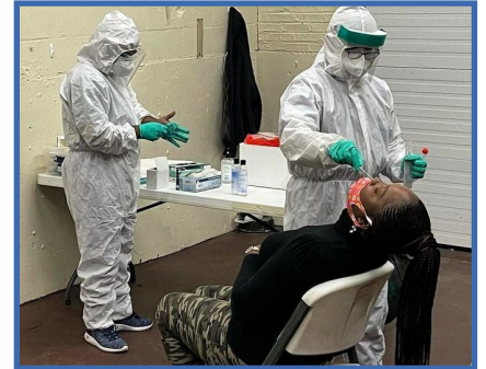
The Douglas Center conducts weekly Covid-19 testing for all staff and participants..