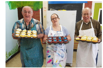
The Douglas Center "Birthday Bakers" are ready to present their baking creations.

A delightful extension of this programming is called the "The Douglas Center Birthday Bakers." This a group of about four to five program participants who come together once a month to bake and decorate birthday cupcakes for their fellow participants who are celebrating a birthday in the current month. The "Birthday Bakers" group provides them with an opportunity to learn and to improve their cooking and baking skills in addition to bringing a great deal of joy to the birthday celebrants.