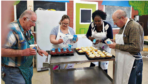
Program Participants of the "Birthday Bakers" group add the finishing touches to their bakery creations for the birthday celebrants of The Douglas Center

The Douglas Center prides itself on providing a wide range of meaningful program choices for its program participants with special needs. The center's programming includes art, music, horticulture, physical recreation, vocational training as well as its many clinical services. In keeping with its mission, the focus of the center's programming revolves around assisting adults living with intellectual, developmental and physical disabilities in the improvement of their independent living skills and enrichment of their quality of life. The Douglas Center provides opportunities for its participants to acquire many of the practical and necessary skills needed for everyday living.