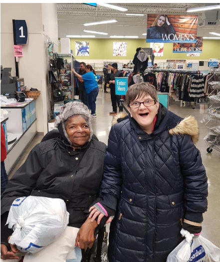
Program Participants of The Douglas Center enjoying their holiday shopping experience courtesy of Goodwill Cares.

The Douglas Center was the recent recipient of $1000 in Goodwill voucher certificates from the Goodwill Cares program. The Goodwill vouchers were distributed by The Douglas Center to their program participants during the holiday season. This is the second year that the Goodwill Cares program has provided vouchers to our participants.